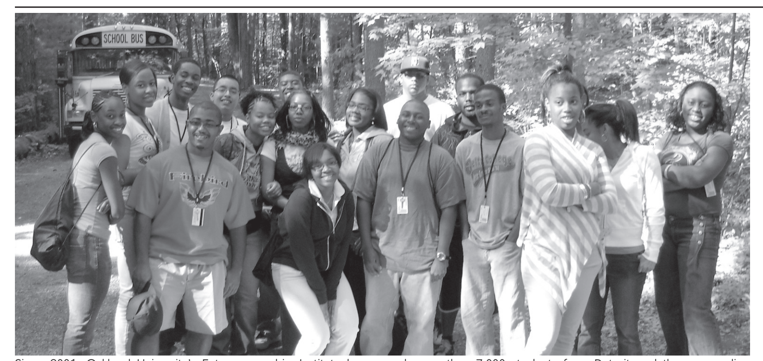
Since 2001, Oakland University's Entrepreneurship Institute has served more than 7,000 students from Detroit and the surrounding communities. During the Entrepreneurship Summer Camp, area teens participate in team-building exercises, attend classes and work in small groups to develop business plans for their products or services.

August 19-25, 2009 THE MICHIGAN CHRONICLE Page B-3